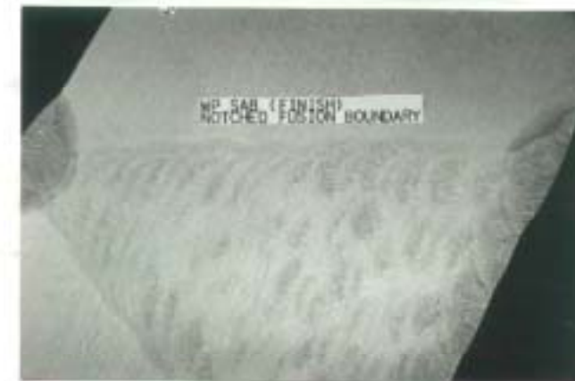
Figure 4 Magnification X1.5 approximately, 3% nickel weld. A close-up of the attacked fusion boundary.